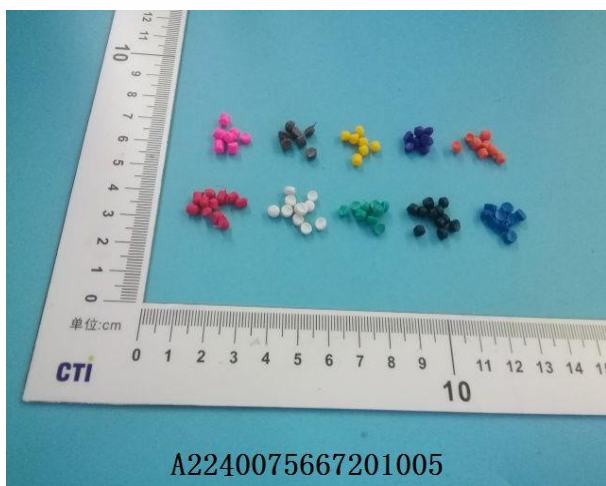
Client Reference Photo (Non tested sample)